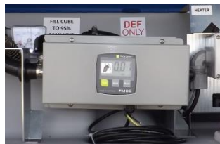
Pulse Meter Option