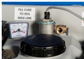
Internal Probe Heater