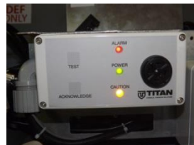
Overfill Bund Alarm