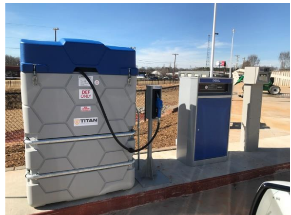
Island Ready Footprint