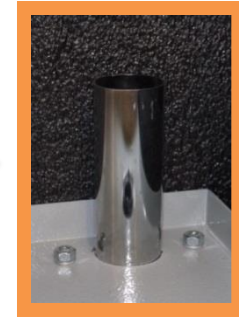
Temperature probe installed. Temperature control activated at 30°F