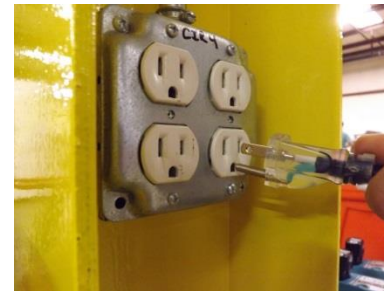
Connect the male end of the extension cord to a standard 110V power source.