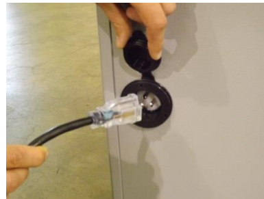
Plug the female end of the extension cord in to the standard 110V plug installed in the side of the PDU.