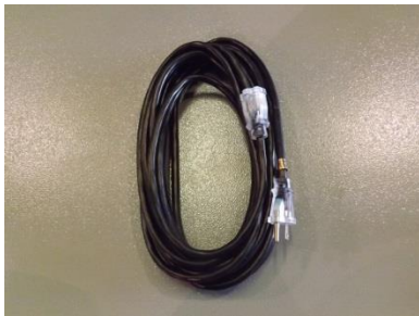
Locate the 20 ft. industrial grade extension cord.